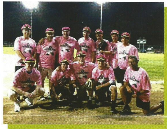
AEP/Ceres Softball Team

The barge division of American Electrical Power is making waves for cancer research. Mary Crowley was invited to Kirkwood, Missouri on August 17, 2013, to attend their annual employee golf and softball tournament. The company pledges proceeds of the celebration to charity and encouraged by BIG HOPE 1, Mary Crowley was selected to receive a portion of the funds that netted $21,000. Ceres Barge Line was one of the competing softball teams to raise funds and were a "home run" in pink uniforms!